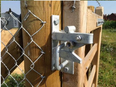
Tunstall Flood Basin